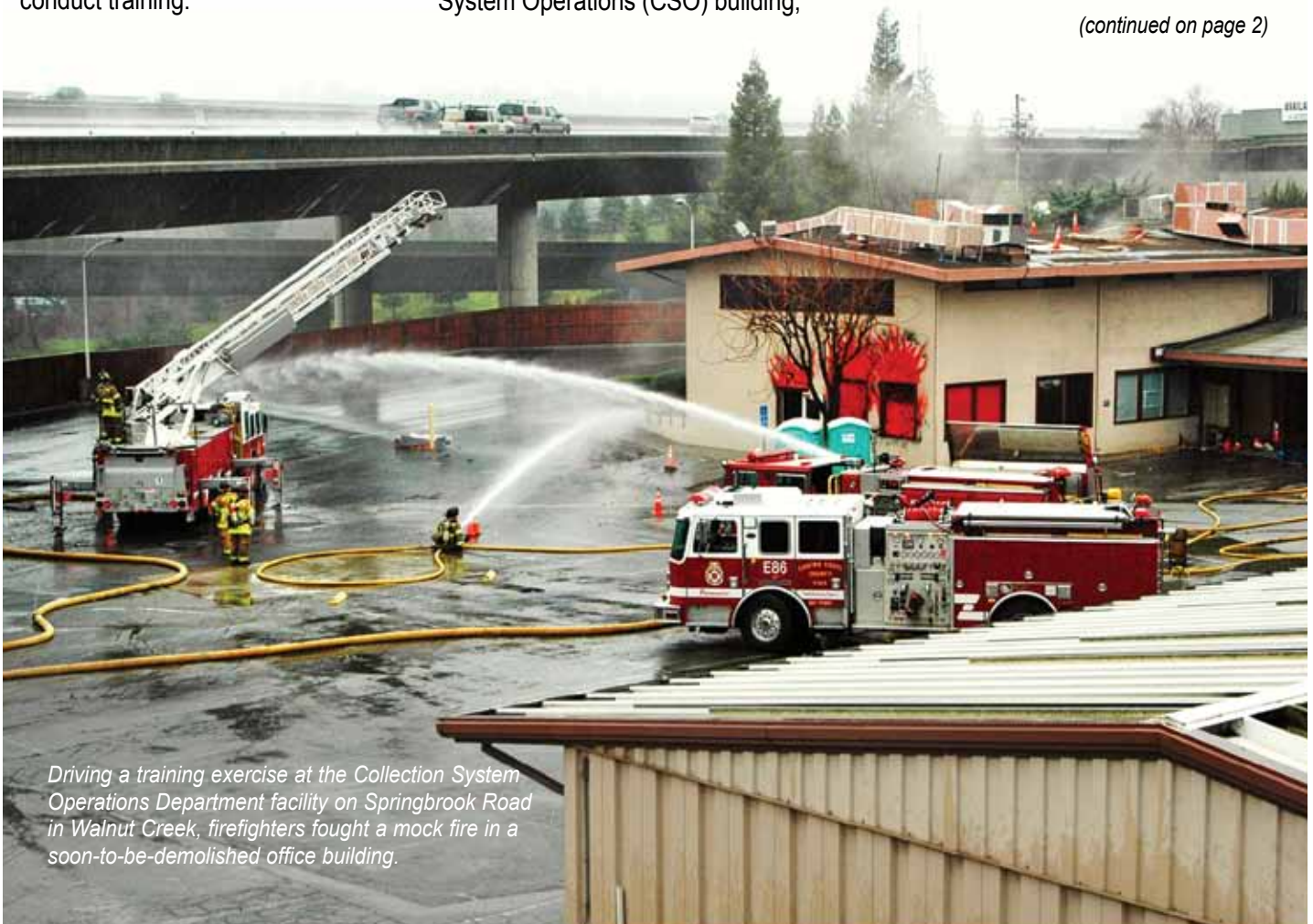
During a training exercise at the Collection System Operations Department facility on Springbrook Road in Walnut Creek, firefighters fought a mock fire in a soon-to-be-demolished office building.