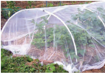
Row covers keep snails out.