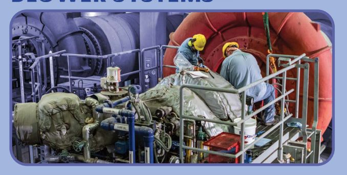
INFLOW & OUTFALL