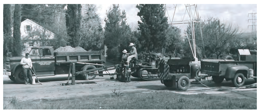
Many of the pipes installed in the 1950s and 1960s (like those shown above) may need to be replaced.