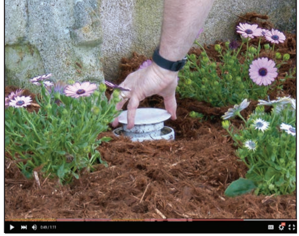
Watch our new video at YouTube.com/CentralSanDist