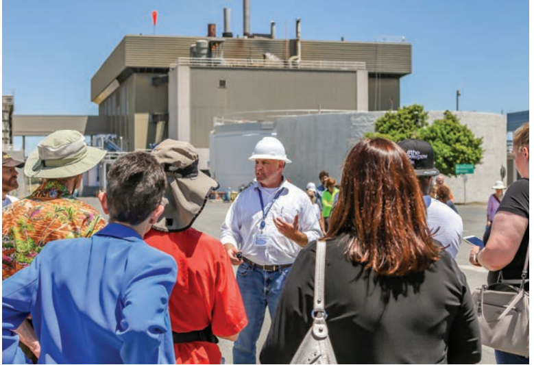
More than 300 people took a guided tour of our awardwinning wastewater treatment plant.