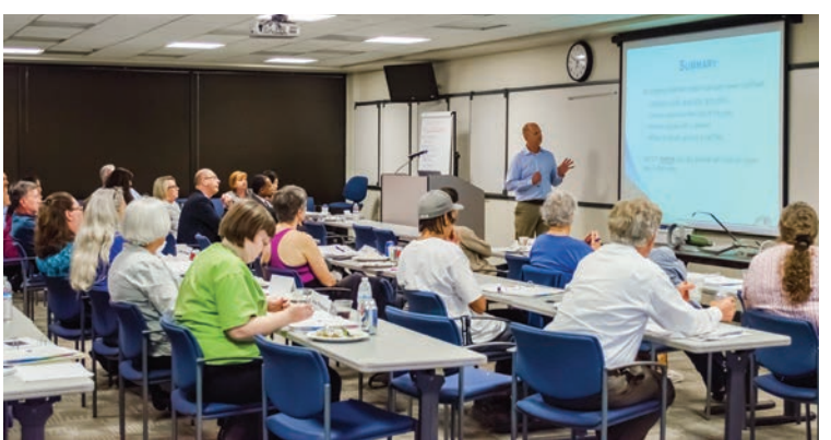
The Academy offers a mix of classroom settings and guided tours of the plant.

In addition to receiving classroom presentations and doing group exercises, participants toured our treatment plant,