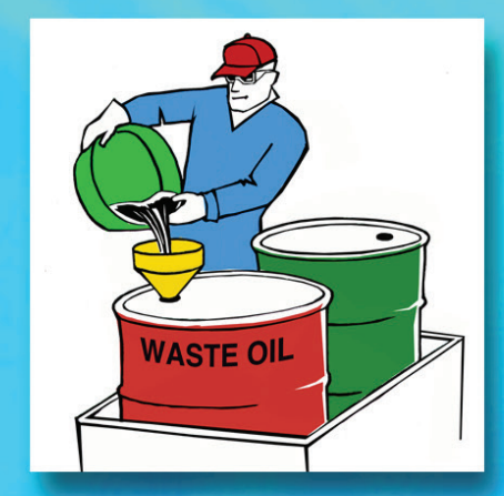
Keep wastes in secondary containment (containers inside containment)