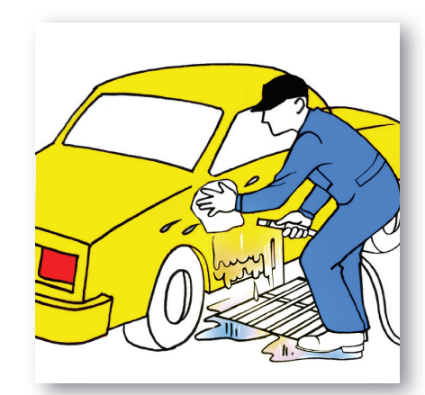
Wash vehicles over an oil/water separator, <u>NOT</u> to a stormdrain.