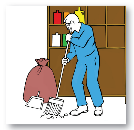
Clean up spills right away.