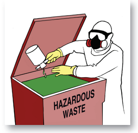
Minimize spillage when transferring wastes to containers.

control the discharge quality of its process wastewater (e.g., maintain operating logs, conduct monitoring of flow, complete periodic sampling and analysis for specified pollutants, submit reports/certifications). Businesses that are permitted by the Environmental Compliance Program may be assessed fees to reimburse Central San for costs associated with implementing the Environmental Compliance Permit Program.