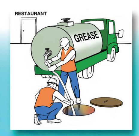
Maintain grease interceptors properly, e.g., schedule periodic pump out.